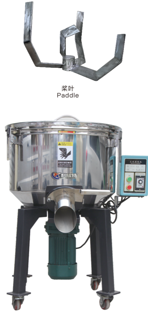
圆型下料口 Round discharge opening 高端型搅拌机下料口分为方口和圆口两种, 两种下料口都是最新型设计都不会卡料 The discharge opening of high-end mixers is divided into two types, square opening and round opening. Both feeding openings are of the latest design and will not jam materials.