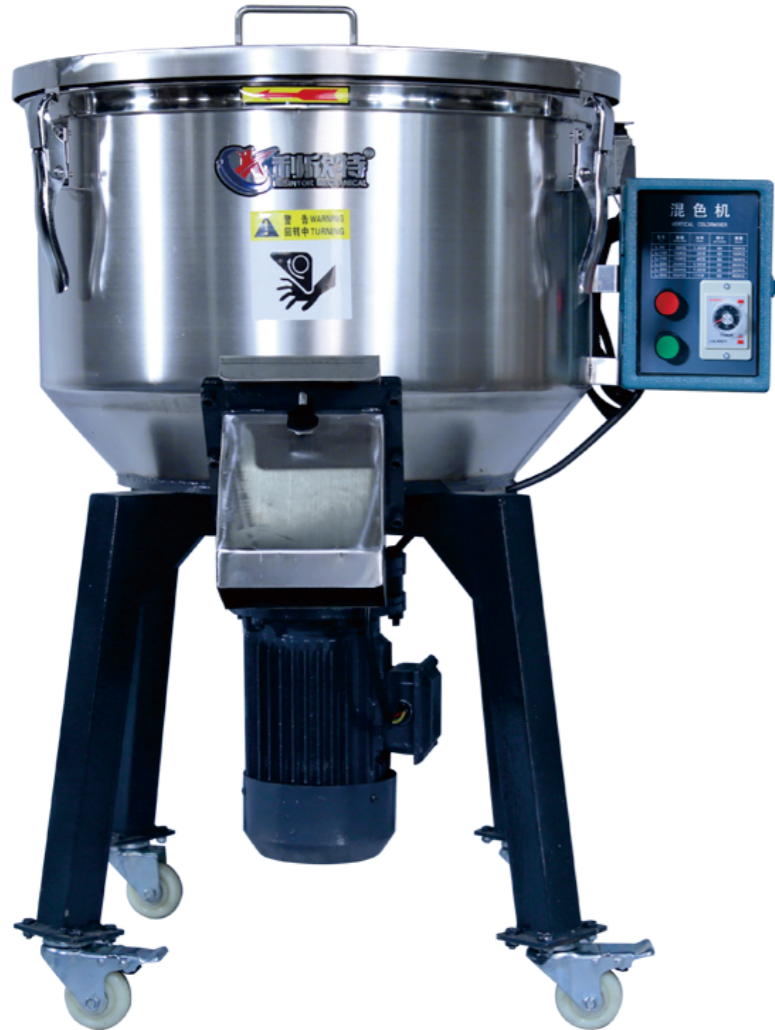
方型下料口 Square unloading port 标准为拉丝面加厚不锈钢, 可定制镜面 standard brushed surface and thickened stainless steel, mirror surface can be customized